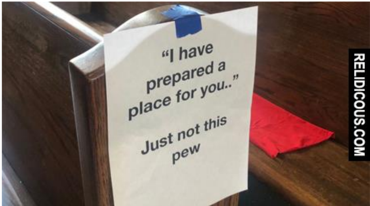
Social Distancing in Church